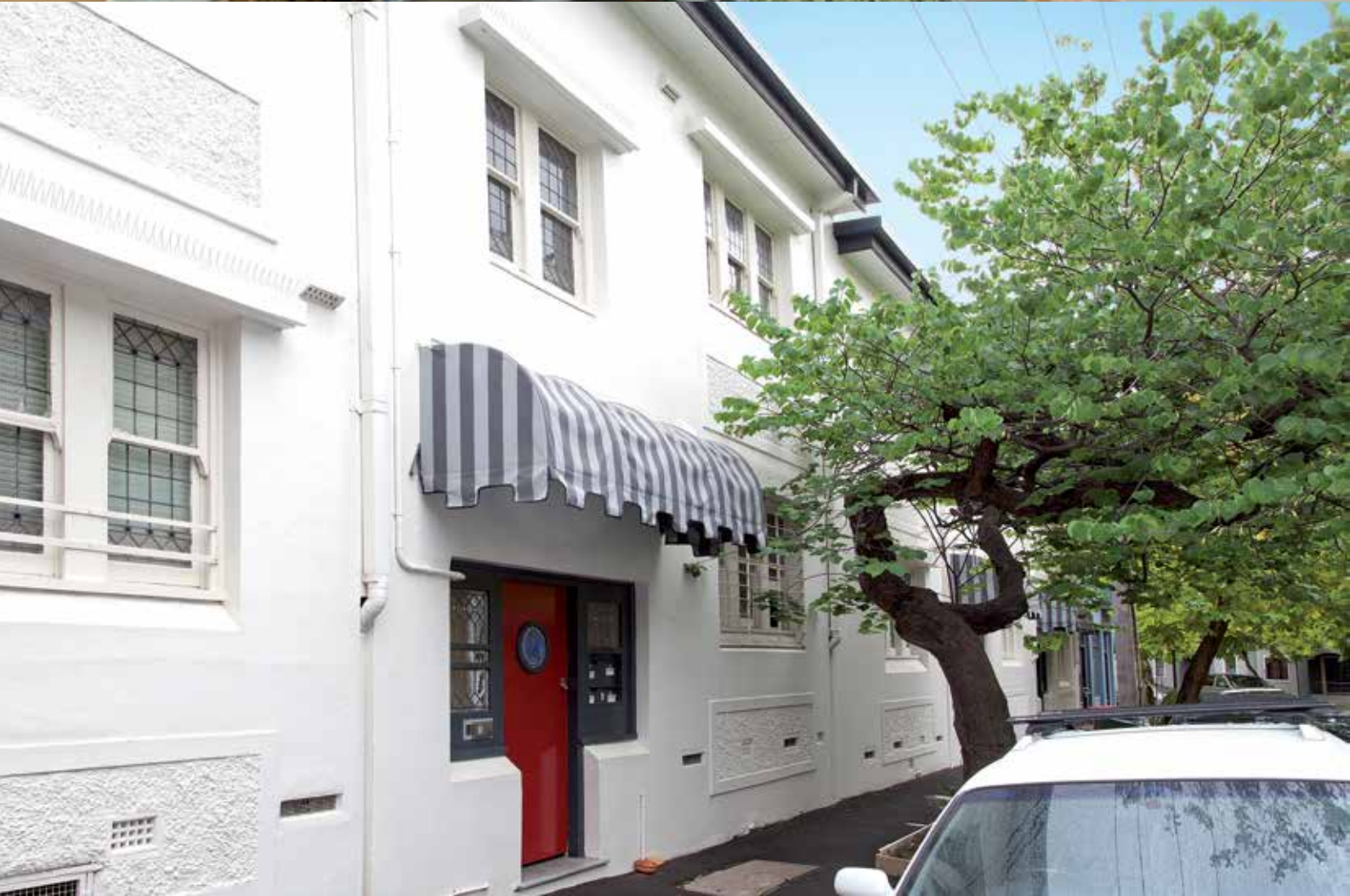
TOP SURRY HILLS APARTMENT